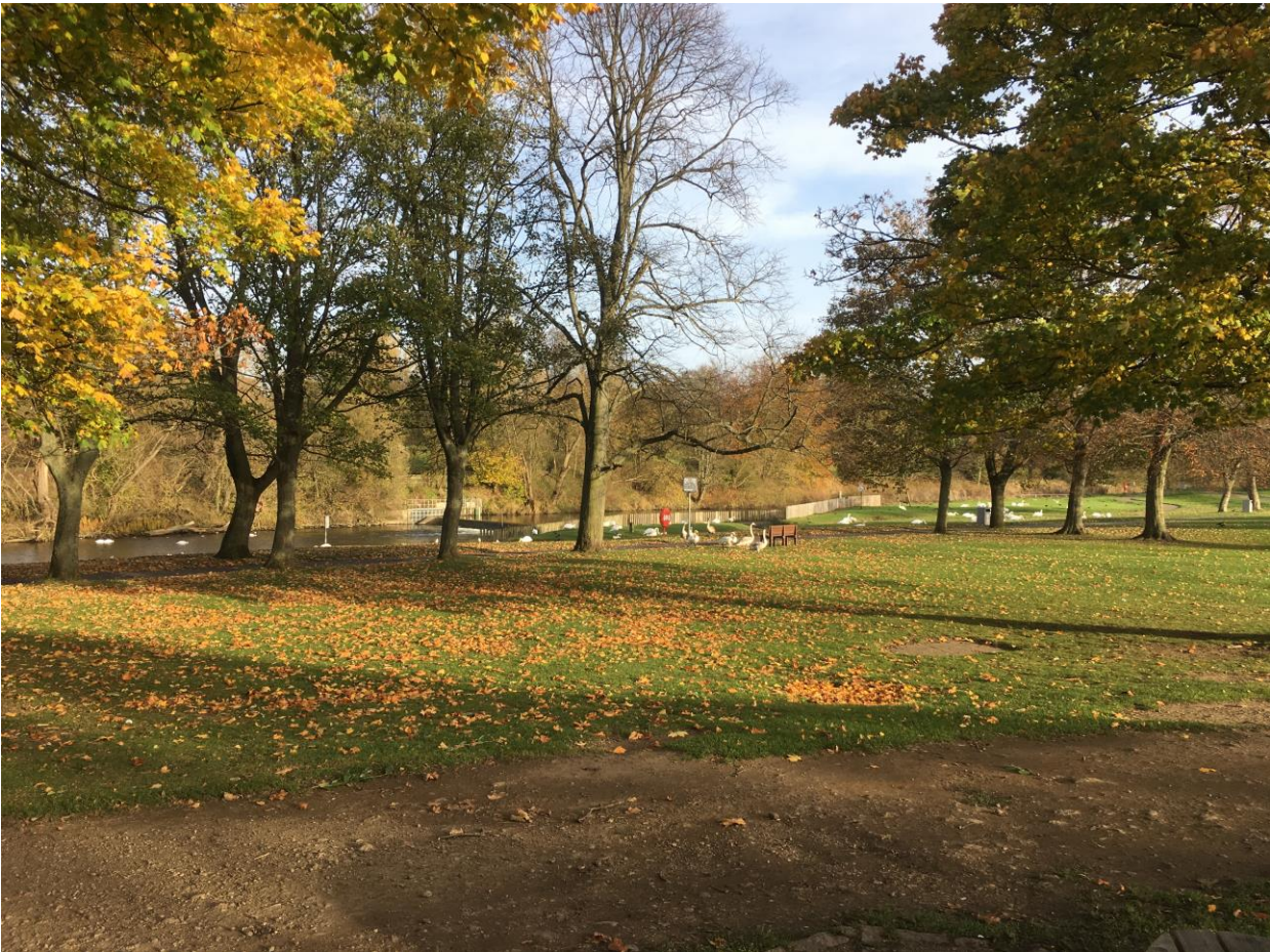
Riverside Park – Chester le Street

Crime and Disorder Select Committee Stockton-on-Tees Borough Council Municipal Buildings Church Road Stockton-on-Tees TS18 1LD